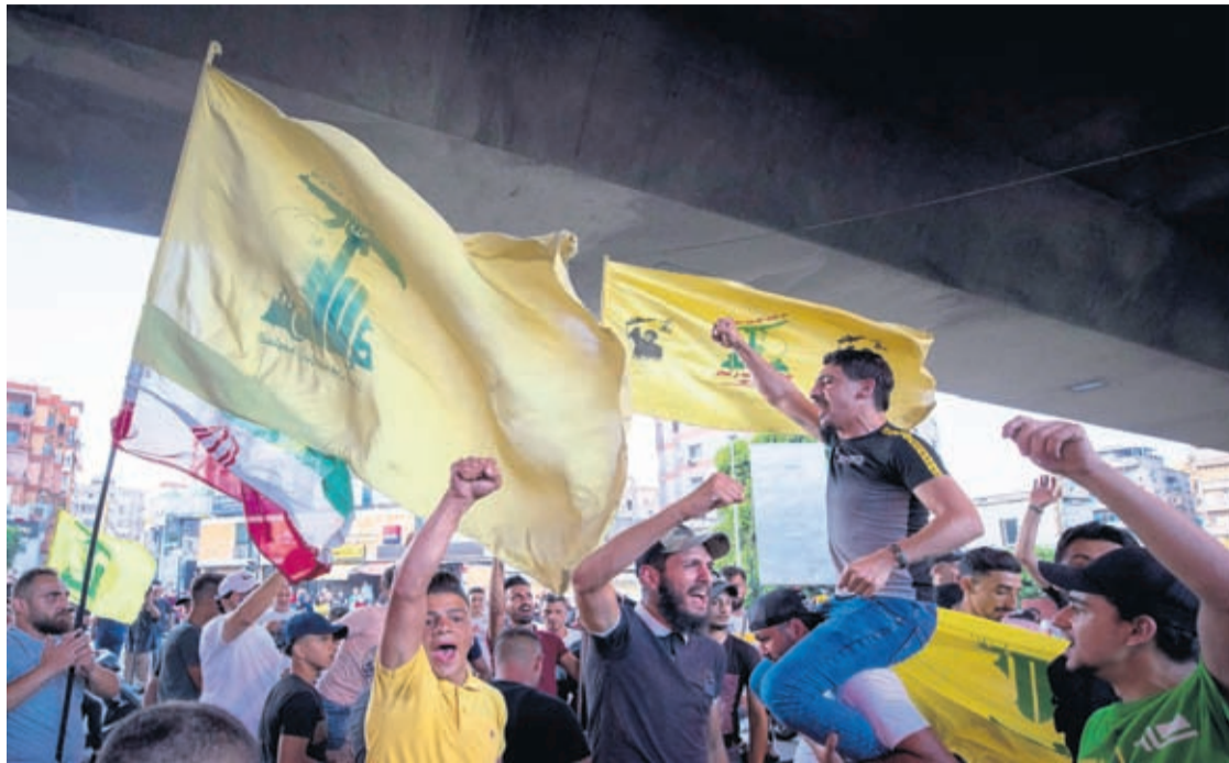
In this June 28, 2020 file photo, Hezbollah and Amal supporters wave Hezbollah and Iranian flags as they shout slogans against Israel and U.S. during a protest in the southern suburb of Beirut, Lebanon.

Cardboard effigies of Hezbollah's leader, Hassan Nasrallah, and other politicians were hanged on nooses at a rally after the blast. Some